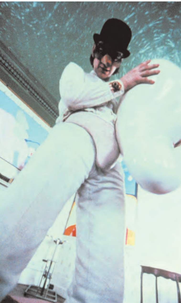
Alex kills the „Cat-Lady“ with a giant phallus.

A CLOCKWORK ORANGE emblematically uses the language of clothes to radically negate the 'brave new world' as put forward by futuristic fashion design. "What kind of a world is it at all? Men on the moon and men spinning around the earth and there's not no attention paid to earthly law and order no more?" wonders an old and drunk tramp, who, lying under a dark bridge, is being harassed by four perilous shadows circling around him. And he is indeed about